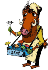
The First SPICE Group 10 th Anniversary Workshop

Part 2: The SPICE Workshop: Certainly you want to see some impressions from the workshop . Participants provided short statements as basis for intensive and fruitful discussions. There is too much to learn about global developments in business incubation. To mention just four examples: