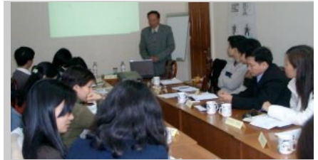
Training course in Hanoi with business